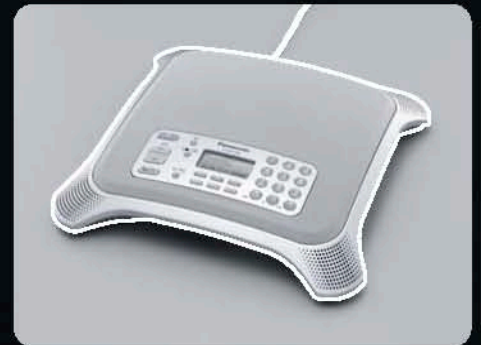
KX-NT700 IP Conference System

NCP500X and NCP500V both come with wall mount brackets as standard.