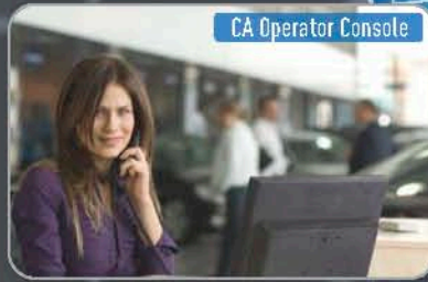
CA Operator Console