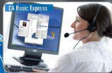
CA Basic Express