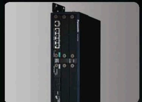
KX-NCP500X/V Wall Mount Bracket